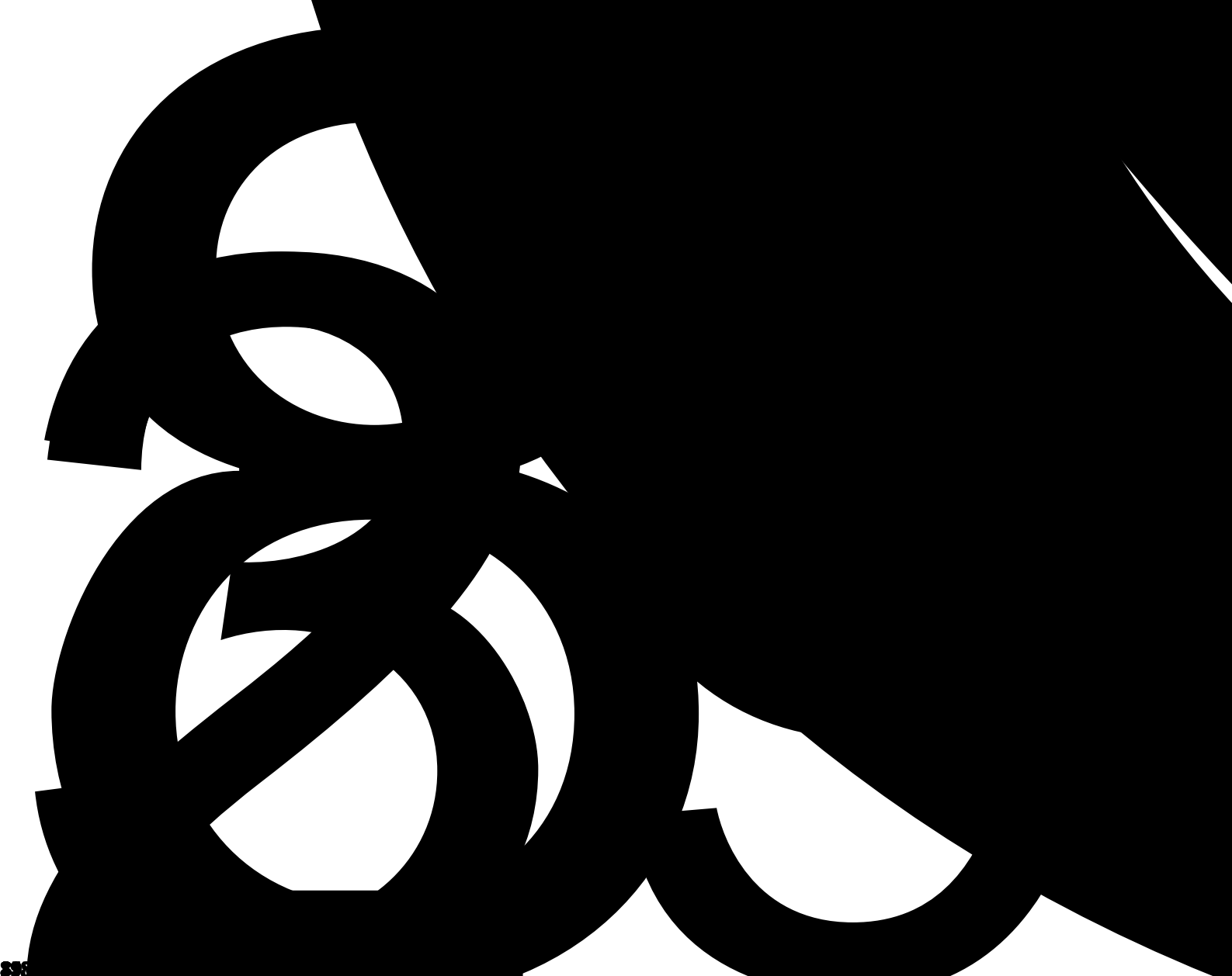
Table 3 2,5,4 at le C514 T 7