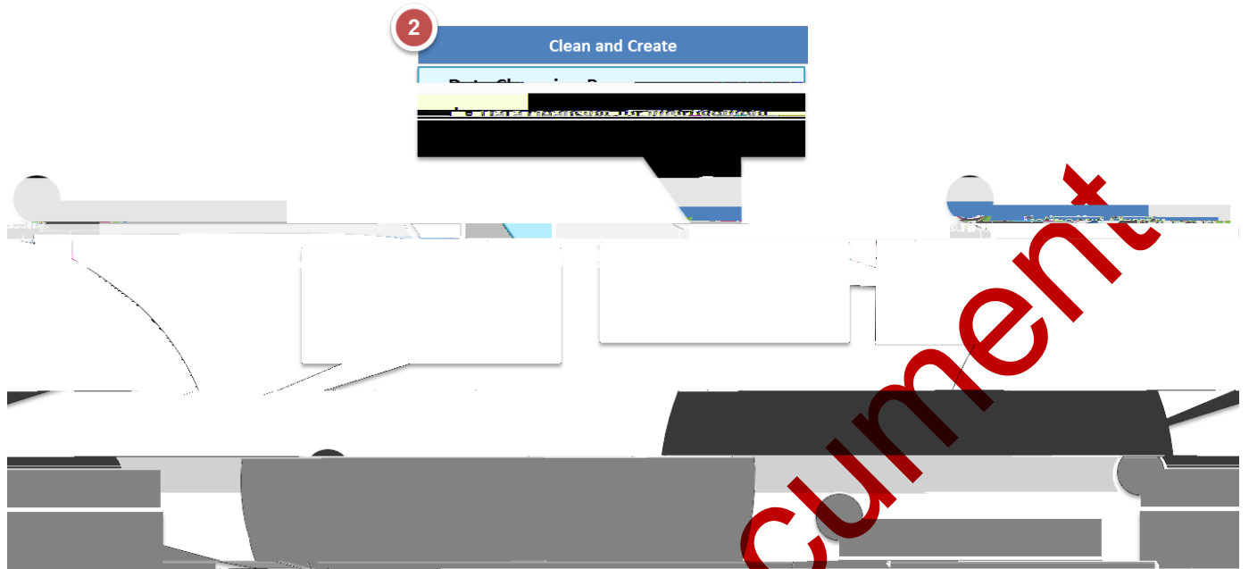
Fig.0 - Data Management